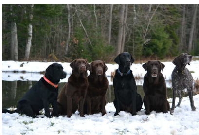
Bentley, Jazzie, Nessie, Moxie, Lottie, Ernie (from left to right)